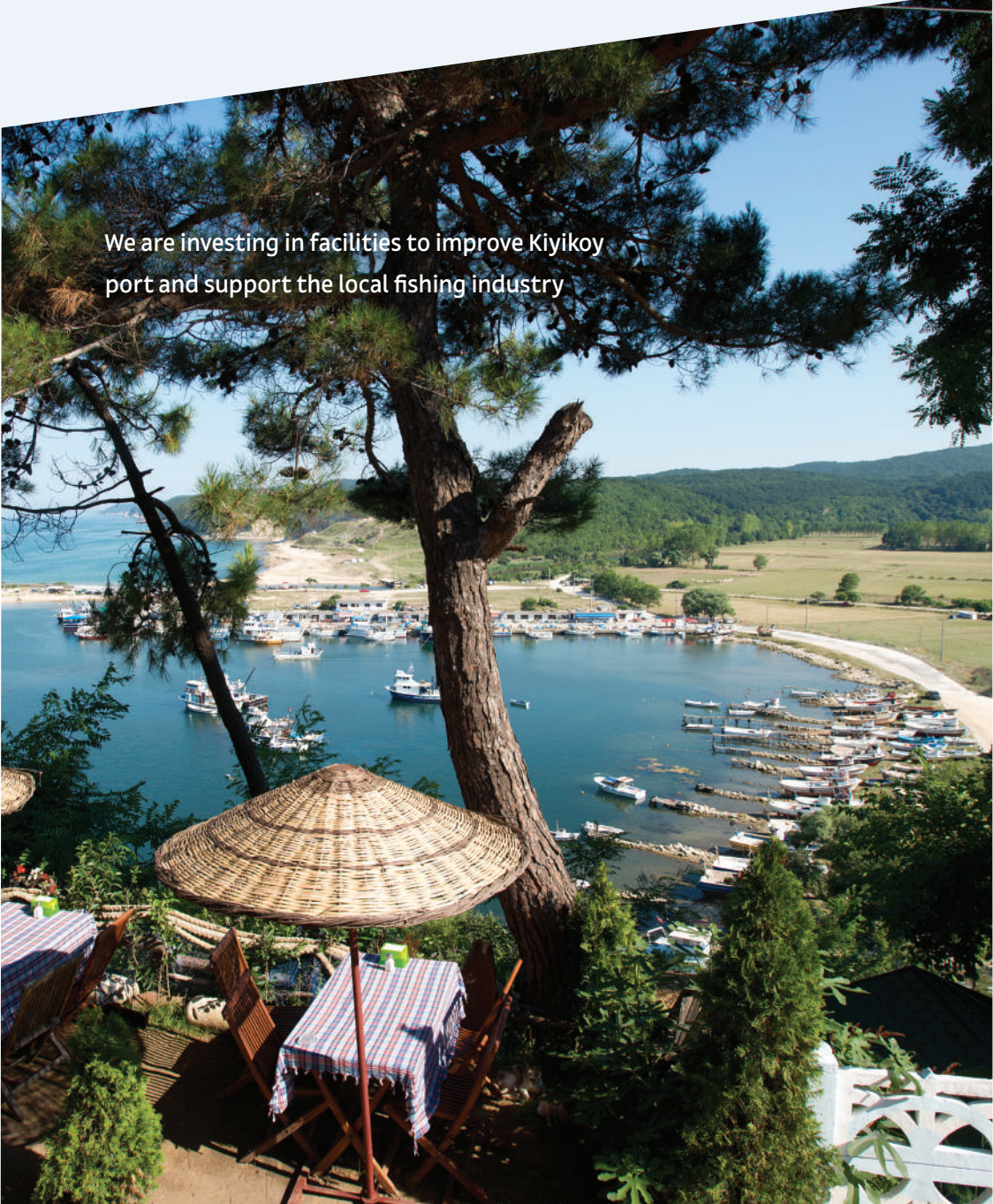
We are investing in facilities to improve Kiyikoy port and support the local fishing industry

Our Community Investment Programme aims at directly benefit local communities that are close to the activities of the Offshore Project in terms of socio-economic development. These include the communities of Kiyikoy, Bahceköy and Güngörmez. We also target projects or causes that support the protection and preservation of the local onshore or Black Sea marine environment where our Project is located. We may also support projects or programs in the wider Vize area, Kırklareli region, or at national level. Such projects include awareness raising of particular environmental issues, exhibitions, or research papers and publications.