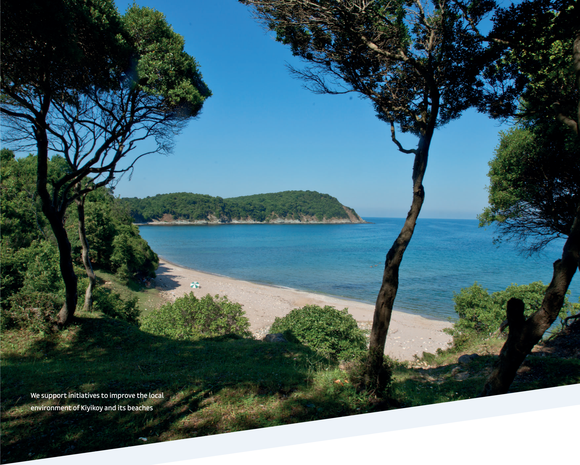
We support initiatives to improve the local environment of Kiyikoy and its beaches

Our Community Investment Programme aims to cover a mixture of short, medium and long-term projects and programs aligned to one or more of these areas.